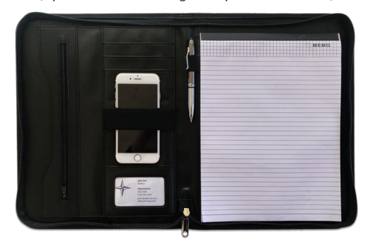
(Open - Interior View - *Legal Notepad included ONLY)

<u>Air Shipment:</u> 4 - 5 weeks lead time after approval. <u>Sea Shipment:</u> 14 - 16 weeks lead time after approval.