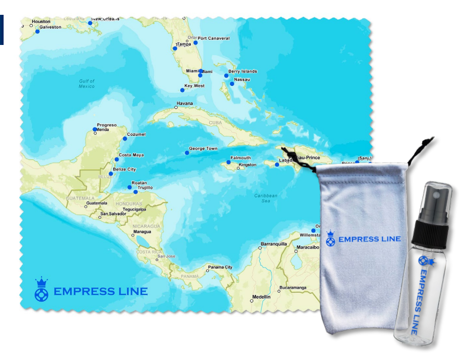
Optional pouch + spray cleaner